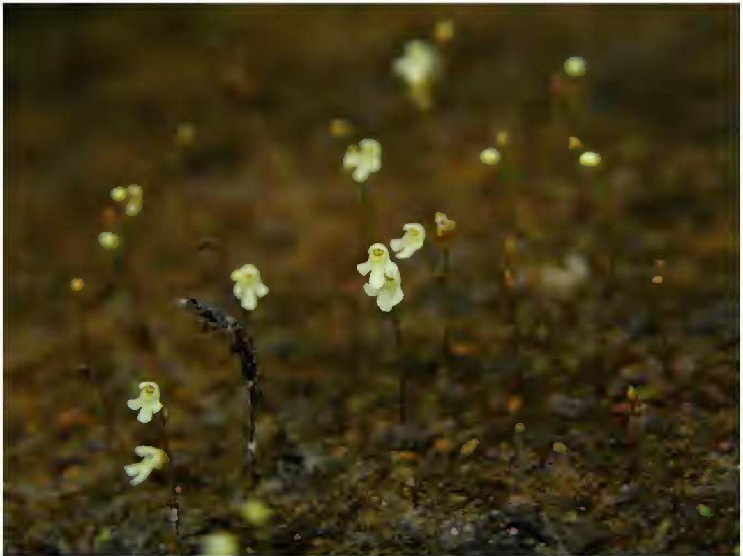
Figure 1: Utricularia oliveriana growing attached to sandstone rock in shallow, running water at a river margin, Gran Sabana, Venezuela.